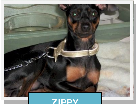
ZIPPY Rescued 2011

Together we can work to drastically reduce these figures. Please find Spay/Neuter resources on Page 3 of this newsletter.