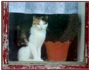
An Indoor Cat is a Safe Cat

Phone: 617.846.5586 E-mail: MassPAWS@aol.com Web: MassPAWS@petfinder.org