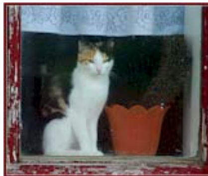
An Indoor Cat is a Safe Cat

MassPAWS the Massachusetts Progressive Animal Watchdog Society has an eye on animals in Massachusetts, and the animals are the beneficiaries.