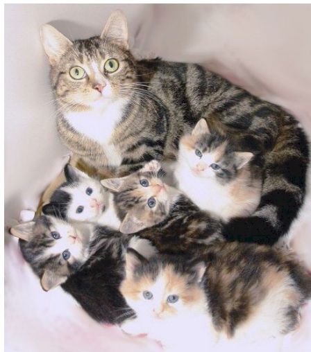
"This is not a blessed event"

When you foster a dog or cat, you are saving a life! Each animal placed in a foster home frees up one space in boarding, allowing us to rescue one dog or cat from the pound or an abandoned animal left on the streets.