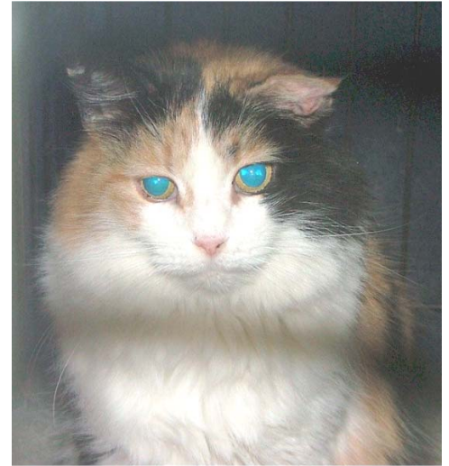
victim of neglect which will kill her at a young age.

There is not a good explanation why they should not have been treated as our own pets are. We are happy that their lives are better as a result of our intervention; but sad that Bertie is a