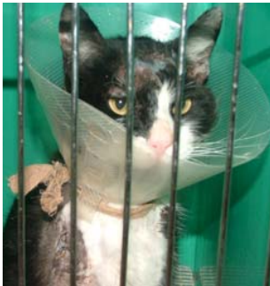
When this little guy was found last winter, his head and both shoulders